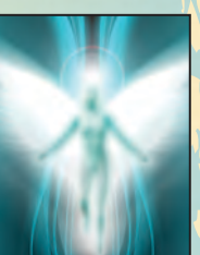
Living Beyond the Veil